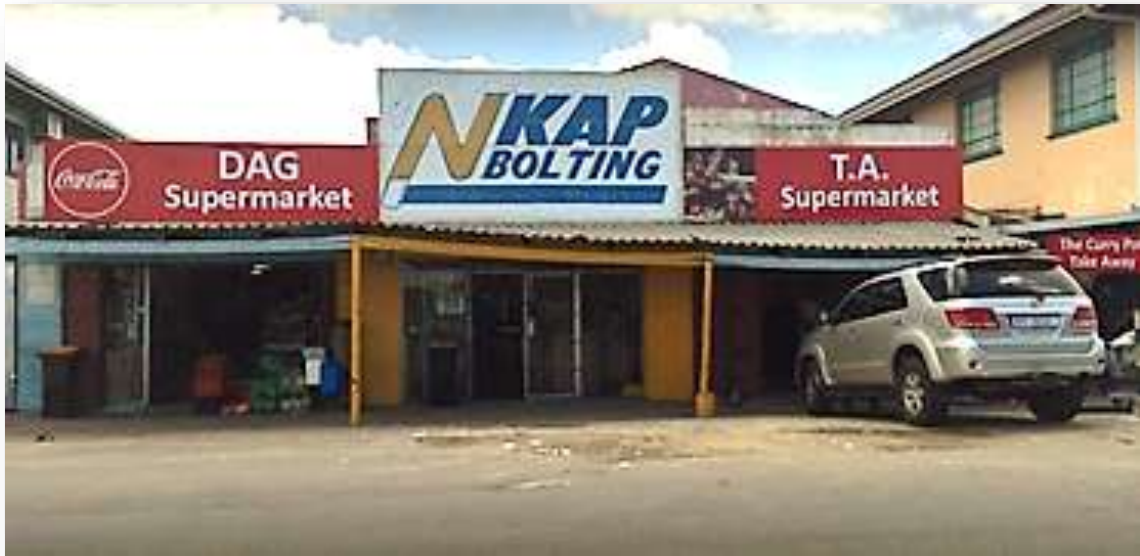
Figure 2 NKAP Bolting